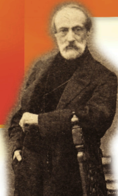
Giuseppe Mazzini, around 1865