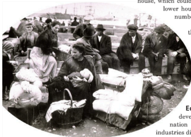
Italian Emigration Emigrants crowd the port of Naples (above). Why did Italians immigrate to other countries in the early 1900s?