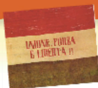
Flag of Italy, 1833