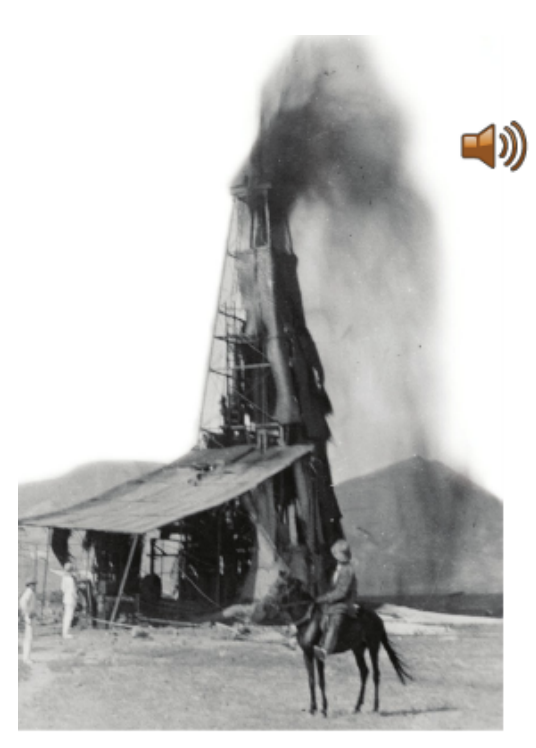
Oil flows out of one of the first oil wells to be drilled in Persia, around 1910.

Egypt was unable to repay loans he had contracted for the canal and other projects. To pay his debts, he sold his shares in the canal. The British bought the shares, gaining a controlling interest in the canal.