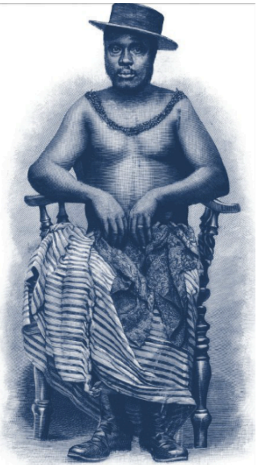
▲ King Lobengula of the Matabele nation in present-day Zimbabwe