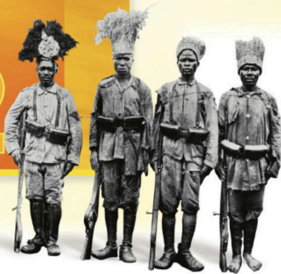
African soldiers in German uniforms